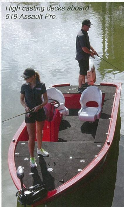
High casting decks aboard 519 Assault Pro.