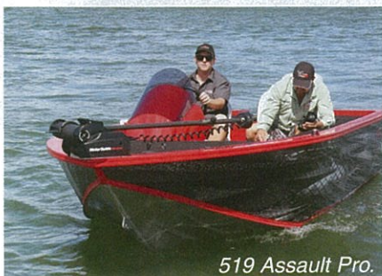
519 Assault Pro.