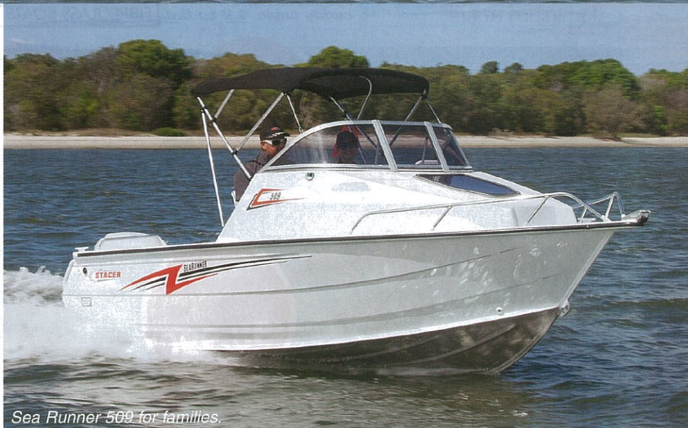
Sea Runner 509 for families.

The hull beams and interior widths have also been increased and sporty low-profile decks incorporated on a number of models. The all-new 449 Baymaster is a good example; the Baymaster not only has a stylish sports deck but increased internal space by