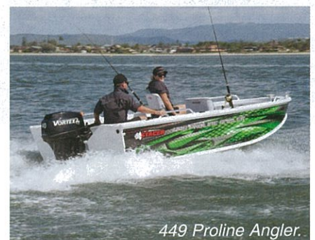
449 Proline Angler.

plus fighter jet style helm console. Top speed is 50 knots on this red-hulled flyer fitted with an Evinrude 135hp ETEC on the transom. This 5.2m long 'total weapon' will no doubt be soon featuring at major inshore barra, bass and bream fishing events.