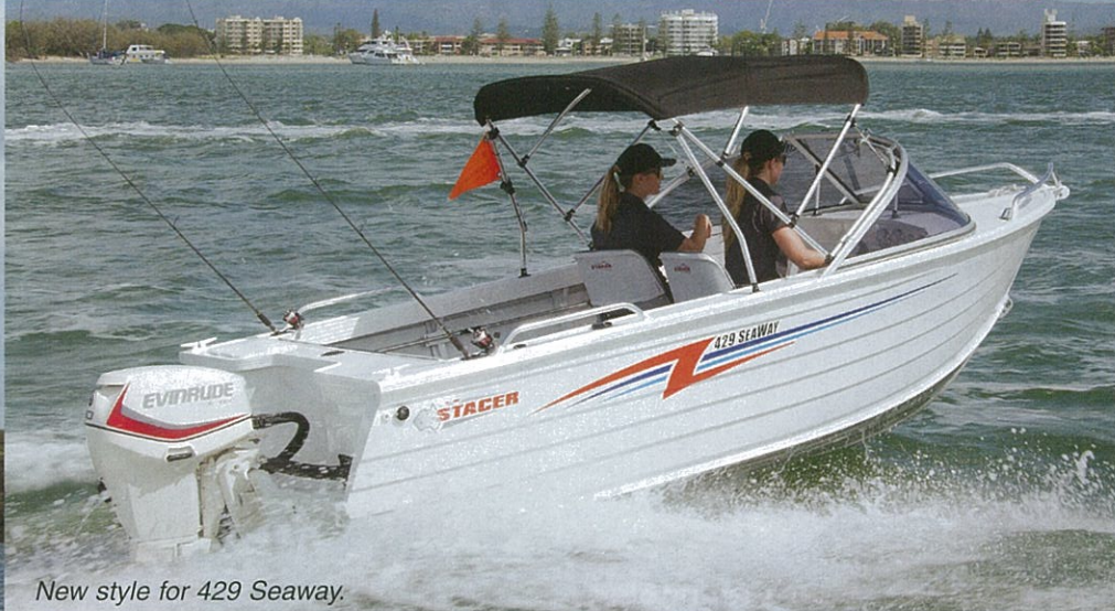
New style for 429 Seaway.